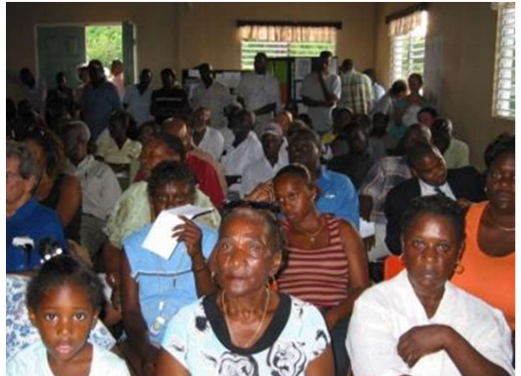
Public hearing on hotel development, Jamaica 2005

Decisions, reasons & how public comments were taken into account to be made public