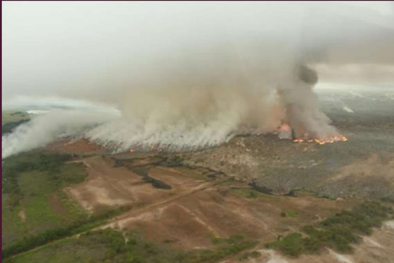
Riverton Landfill on fire (2014)