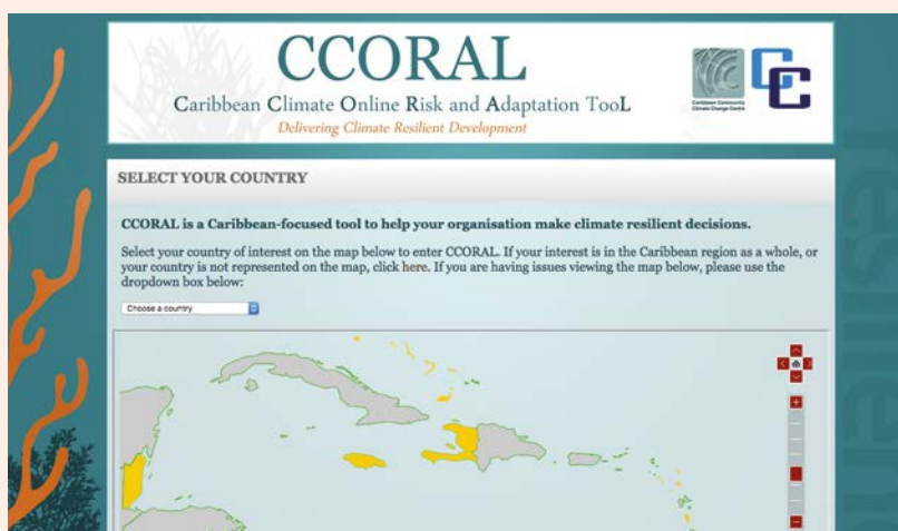
The CCORAL homepage

CCORAL can be applied by all sectors, and is available online at: http://ccoral.caribbeanclimate.bz